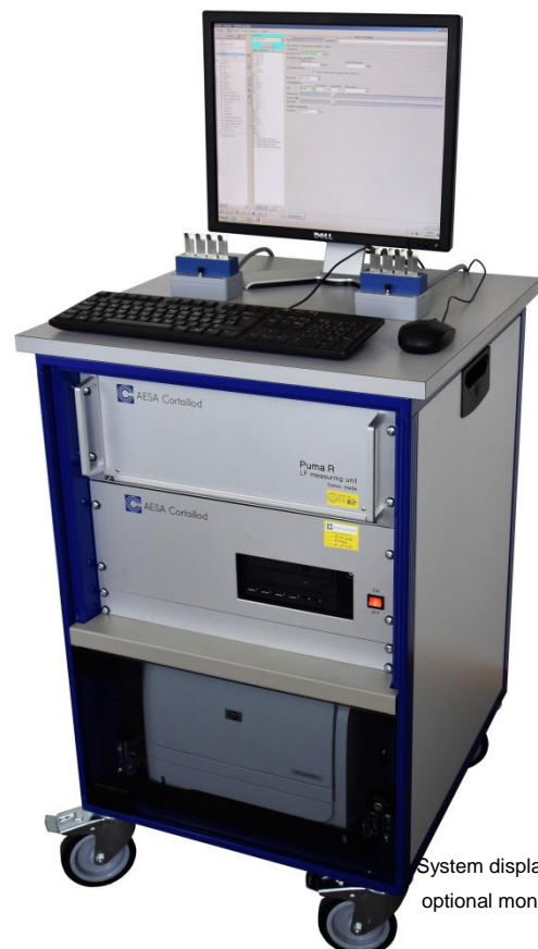
System displayed with optional monoplomers

Puma can accept one or two monoplomers (for 2 pairs or 1 quad) for single or double end measurements (long cables) as well as the use of connecting frames allowing the connection of cables reaching up to 128 pairs.