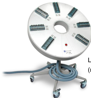
LFT56 (round shape)